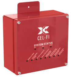
Remote Annunciator Panel

The Cel-Fi QUATRA RED Remote Annunciator Panel provides automatic supervisory signals for malfunctions of the ERRCS solution. It complies with NFPA and IFC fire codes. The PoE architecture allows for a quick installation and alarm configuration. The unit is NEMA4 rated.