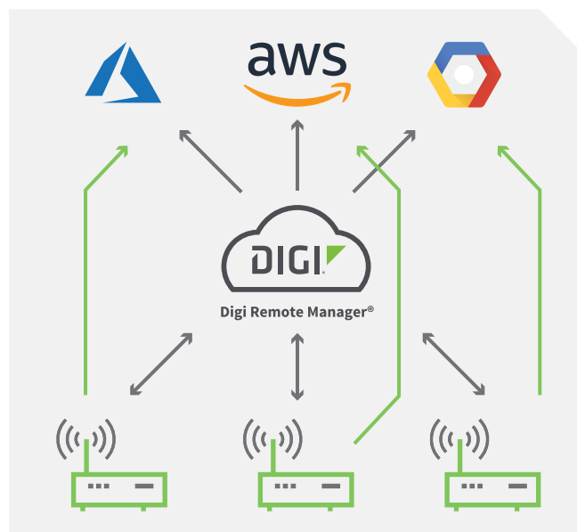
If each device requires a unique out-of-band connection to the IoT cloud, DRM simplifies the management of the IoT client on each router.