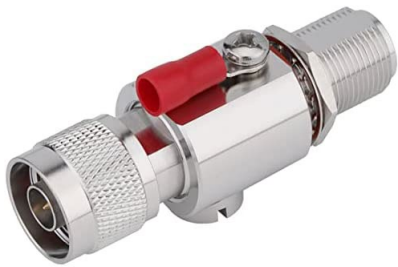
Lightning Arrester – N(F) to N(M)