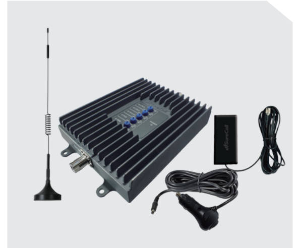
The SureCall Fusion2Go kit